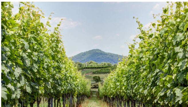
Early Mountain Vineyard, one of Virginia's premier wineries has been named the #1 Place for Weddings by The Knot magazine; and America's #1 Tasting Room by USA Today.