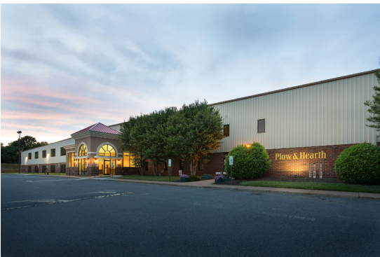
Founded in 1980 as a small country store, Plow & Hearth has grown into a leading retailer of enduring products for home, hearth, yard and garden.